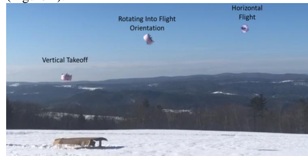
Figure 2. Ring-Wing Vertical to Horizontal Flight

The ring-wing configuration utilizes a quadcopter propeller arrangement and a novel nonplanar wing design to improve flight control characteristics and improve structural rigidity. This configuration creates a highly maneuverable drone capable of rapidly transitioning between vertical and horizontal flight (Figure 2).