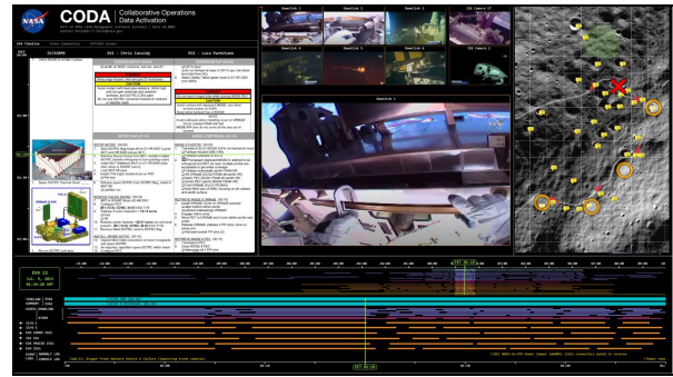
Figure 3: CODA integrated EVA prototype design

provide it all in a common interface for enabling an integrated playback ability? This idea in action can be found on the Apollo in real-time works [9].