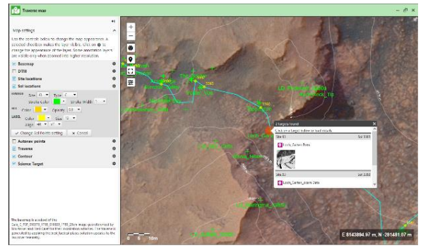
Figure 2. Screen capture of the MSL AN Map tool with the settings panel shown on the left. In the map (right), a popup shows science targets defined at a given location.

Online Help. Traverse Map help is provided if the question mark icon on the top menu bar in Figure 1 is clicked.