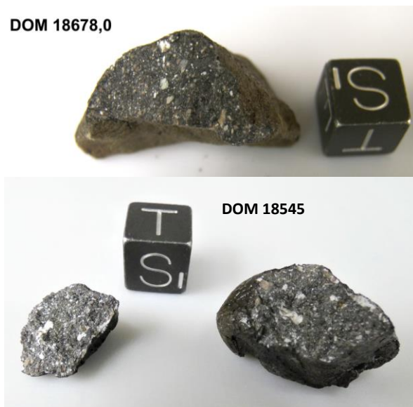
Figure 2: Macroscopic images of lunar meteorites DOM 18678 and DOM 18545, illustrating the basaltic (dark) and feldspathic (white) clasts as well as the dark matrix.