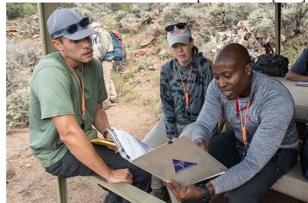
Fig. 2. Astronauts from Class 23 (The Flies) making a geologic map during their Phase 1 geology training.

Phase 1: Astronaut Candidacy – Basic geological training: Incoming astronauts enter a 2-year training flow as a class, learning basic concepts for spaceflight, Russian language skills, EVA training, and foundational Earth and planetary science. During those two years our training team conducts training for the astronauts in basic geology and field methods (Fig. 2). Over the past 14 years and four new astronaut classes, we have refined the content to include one week of classroom content and one week of field mapping in each of the two years of astronaut candidate training (for a total of 80 hours of classroom content and 2 weeks in the field), building upon the geoscience and field content from one year to the next, introducing basic planetary science concepts, and developing expeditionary skills. Details of this flow have been described in earlier publications [6-12].