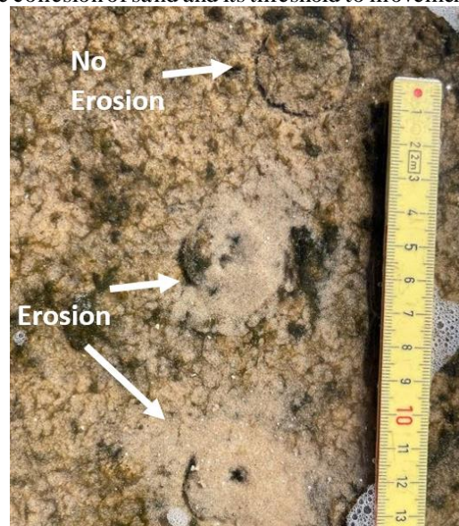
Figure 2: Three different CSM erosion tests on same surface. In the tests where the surface failed a clear puncture in the mat can be seen. This test was performed in ~3 cm of water.

SWERL housing is a cylinder 39 cm in internal diameter and utilizes an annular blade to generate a shear stress on the surface [6]. A suite of optical gate sensors are used to count entrained particles larger than 90 \mu\text{m} [7]. When the number of grains counted by the sensors increases steadily above the level of noise in the sensor it is determined that erosion has initiated. The annular blade rpm can then be converted to a threshold friction velocity ( u^* ) [6,7]. Tests began with the fan blade at 0 rpm and increased steadily to 6000 rpm over 5 minutes. Measurements were performed on a collection of different microbial mat and crust structures. Dune sand was also tested in the field, dried, and tested again in the lab to understand influence of humidity on the cohesion of sand and its threshold to movement.