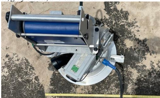
Figure 1: PI-SWERL on 'boundary mat' during erosion test.

Methods: The Padre Island study site features a variety of microbial mats and crusts within tidal flats and interdune areas. These areas experience a mix of aeolian and subaqueous erosion as they fluctuate between subaerial and flooded states. To determine the effect of water and wind shear on the mats, two erosion detection instruments were deployed during relevant field states (dry and flooded). We classified 5 different mats and crusts at Padre Island for this work. These included wave rippled mats, boundary mats, degraded mats, grey crusts, and salt crusts.