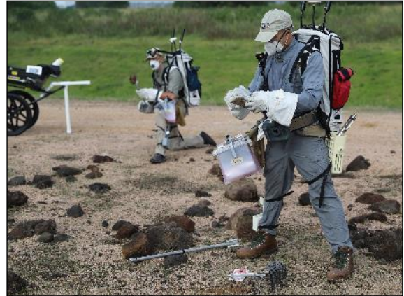
Figure 2 (above): NASA astronaut and planetary scientist crew members doing a simulated EVA at the JSC rock yard to evaluate prototype geology tools and operational concepts in October 2020.

The team has been employing a “test often” strategy. The goal is to manufacture multiple prototypes quickly, integrate them into testing facilities with stakeholders (astronauts, planetary geologists, EVA Operations, human factors, the Exploration Extravehicular Mobility Unit (xEMU) team, and Safety), and ultimately iterate designs based on feedback (Figure 2). This methodology has worked well over the first year of this project and yielded critical feedback that has informed design changes and highlighted important requirements.