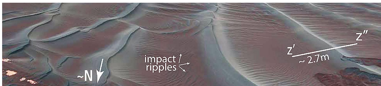
Figure 2. Example of ripple-megaripple interactions in a Curiosity Mastcam mosaic, Enchanted Island, sol 1752. [From Fig 1d of 17].