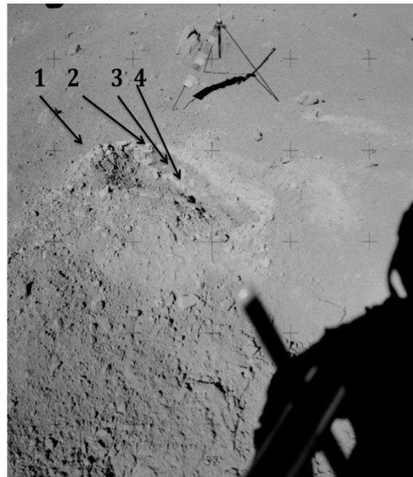
Fig. 2 Apollo 17 Station 3 (EVA-2) trench in rim ejecta of Ballet Crater with indicated location of samples described in Table 1. Long dimension of color chips on gnomon is ~3 cm and gnomon shadow points west northwest. 73001/2 drive tube core site is ~15 m to southwest.

Station 3 Trench Samples: The author dug a shallow trench (Fig. 2) in the rim of the 10 m diameter Ballet Crater and sampled the four irregular, visible units. The characteristics of the four trench samples are summarized in Table 1. These same regolith units may be encountered in the Station 3 drive tube core.