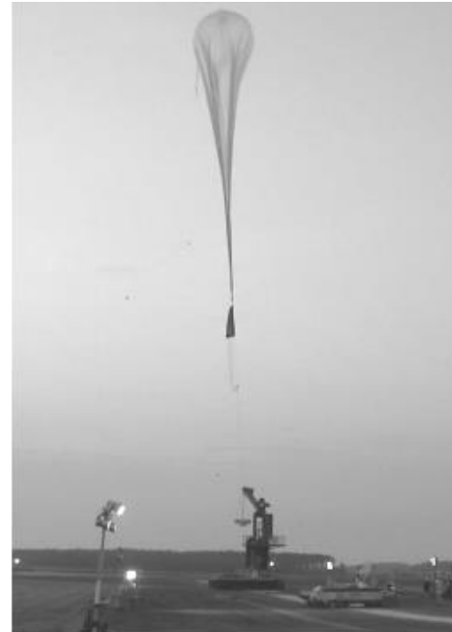
Figure 3: The sampling system was launched using JAXA's scientific balloon on June 8, 2016 from Taiki Aerospace Research Field, JAXA, in Hokkaido, Japan.