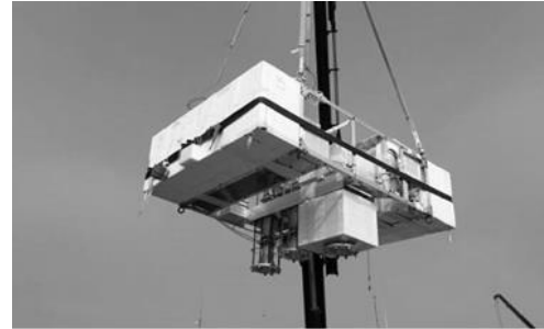
Figure 2: The experimental system.