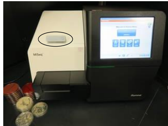
Figure 2. The MinION™ device (circled) sits atop the Illumina MiSeq sequencer. The MinION™ device is a nanopore sequencer that weighs less than 150 g, and occupies a volume of less than 100 cm 3 .

Advances in sequencing technology on Earth have been driven largely by needs for higher throughput and read accuracy. Although some reduction in size has been achieved, nearly all commercially available sequencers are not compatible with spaceflight due to size, power, and operational requirements. Exceptions are nanopore-based sequencers that measure changes in current caused by DNA passing through pores; these devices are inherently much smaller and require significantly less power than sequencers using other detection methods. Consequently, nanopore-based sequencers could be made flight-ready with only minimal modifications.