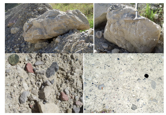
Fig. 4. Big boulders contribute to the cross-bedded diamictite and (upper right) may reveal distinct open, tensile, fractures as a probable result of impact shock spallation. The finer fraction (lower) shows the typical facies of a polymictic, badly sorted sediment with rounded and sharp-edged components.