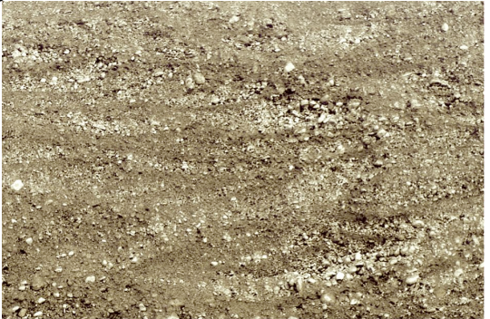
Fig. 3. Close-up of a few smaller cross-bedding units; width of photo about 2 m.