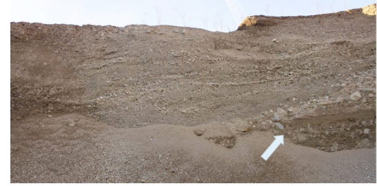
Fig. 2. A prominent cross bedding in the wall of the gravel pit with in part strongly varying grain sizes (arrow). The exposure shown is about 20 m wide and 8 m high.

sharp-edged components is found down to smaller fractions (Fig. 4). Rather unusual for a diamictite, limestone cobbles may show multiple sets of intersecting scratches all around that even may merge into a polish.