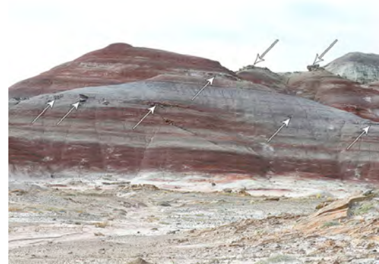
Figure 3—MESR zoom image of Hel. Conglomerate layers marked with white arrows.

For a comprehensive discussion of the geologic interpretations of our landing site, please see the companion abstract from this meeting [13].