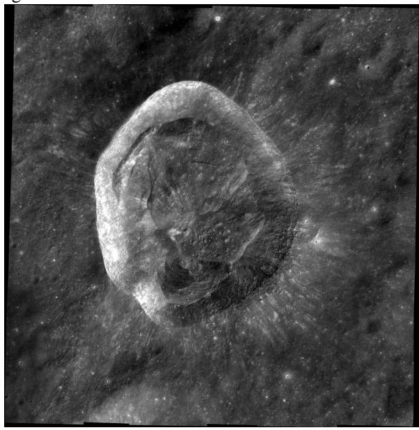
Figure 1: Larmor Q low-Sun controlled NAC mosaic (B) 1.3 m/pix constructed from three NAC pairs, total width is \sim 57 km, north is up.

Introduction: Controlled mosaics from Lunar Reconnaissance Orbiter Camera (LROC) Narrow Angle Camera (NAC) [1] image sequences provide an accurate cartographic framework for a host of scientific and engineering studies. Mosaics are composed of overlapping images acquired over time or from sets of images targeted across sequential orbits. NAC image pairs are first tied to an existing controlled map product: either a NAC Digital Terrain Model (DTM) [2] or an existing controlled mosaic of the area. If there is neither a DTM nor a controlled mosaic available for the area, a different pair of NAC images that have Lunar Orbiter Laser Altimeter (LOLA) cross-over smithed Spacecraft Position Kernels (SPKs) [3] are used. The images are map projected on a pixel-by-pixel basis to the WAC GLD100 [4] for a shape model. After the NAC images for the new controlled mosaic are tied to the best existing ground control, they are mosaicked together.