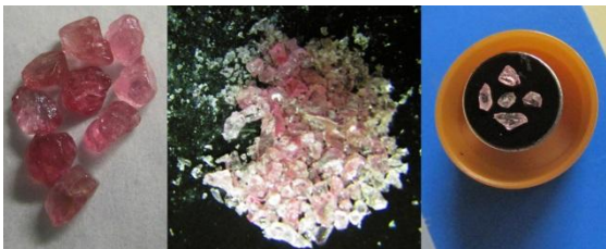
Figure 2. (Left) Rough pink spinel gemstones. (Centre) Crushed pink spinel sample. (Right) Largest grains for SEM EDX analysis.

The particulate pink spinel samples will be ground and sieved further to produce sample material with particle sizes < 25 \mu\text{m} , which is similar to the range of particle sizes that dominate the optical properties of the lunar surface [9]. Fine particulate samples will be measured across thermal infrared wavelengths ( 5 - 25 \mu\text{m} or 400 - 2000 \text{ cm}^{-1} ) under simulated lunar conditions in the Lunar Environment Chamber at the University of Oxford [10]. The near-surface conditions of the Moon are simulated in a vacuum chamber that is capable of maintaining pressures < 1 \times 10^{-4} mbar. Samples are heated from below to 450K using sample cup heaters and the vacuum chamber is cooled to temperatures < 150\text{K} using a liquid nitrogen cooled radiation shield. To simulate incident solar radiation on the lunar surface, a solar-like lamp illuminates the samples, heating the surface of the sample. Radiation emitted from the sample is reflected into a Bruker FTIR spectrometer.