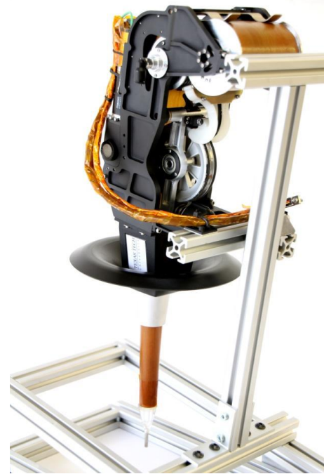
Figure 1. The latest prototype of the lunar heat flow probe with the stem stowed.

bedded on the fully extended stem monitor long-term stability of the thermal gradient.