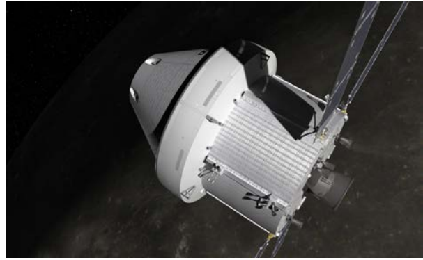
Figure 4. Orion-MPCV, including the ESA provided service module, in orbit at the Moon.

Investigations are also underway into the utilization of human tended infrastructure in cis-lunar space in support of robotic lunar surface missions, including surface mobility and sample return.