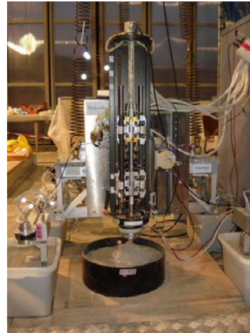
Figure 2. Breadboard of the Exomars drill from which the PROSPECT drill is derived.

PILOT (Precise and Intelligent Landing Using On-board technologies): PILOT provides a navigation and guidance solution to allow safe and precise access to any given location on the lunar surface. PILOT uses a combination of relative and absolute navigation techniques using images for navigation. Hazard identification is performed using LIDAR. Such a system allows access to sites of high interest for science and exploration, for which special extent is highly limited, but also allows coordinated surface access for multi element missions.