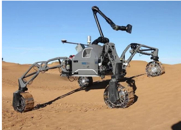
Figure 1: SherpaTT in soft sand dunes during Morocco field trials in 2018.

to make intelligent autonomous robots adaptive to the site-specific environment [9], [10].