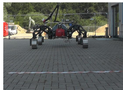
(c) paved ground