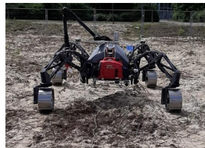
(a) unprepared sand

SherpaTT was remotely controlled to follow an approximately 10 m long straight path over three types of terrain: (i) unprepared sandy terrain, (ii) compact sand/gravel road, and (iii) paved ground. Sand and paved ground represent the two opposite extremes in a terrain classification scale, since sand can be regarded as a high deformable and low traction surface whereas a paved surface offers low/no deformability and high traction. For each terrain, five runs were repeated in forward drive and five tests in reverse drive. The speed of the rover was controlled as 0.1 m/s and 0.15 m/s. In Figure 2, the three different terrain types are shown taken during the experiments.