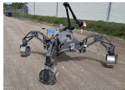
(b) compact sand/gravel road