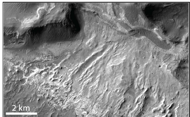
Figure 2. Slopes of the ridge separating Melas basin from Melas Chasma. Relatively brighter material appears to be pasted onto the existing topography. Note top left corner where material appears to conform to the slight doming of the topography giving this deposit a pasted on or glazed appearance. Portion of CTX mosaic.