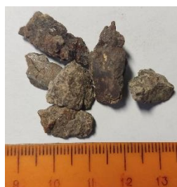
Fig. 1. Calate 015

Meteorites: These meteorites are: chondrite H5 Calate 015 (found 21 Oct 2016, Lat. 21°35.80'S, Long. 69°37.40'W, Fig. 1); chondrite H5 Sierra Gorda 007 (found 31 Mar 2018, Lat. 22°30.59'S, Long. 69°7.40'W, Fig. 2); chondrite L6 Calama 022 (found 2017 Oct 15, Lat. 22°18.192'S, Long. 68°33.0557'W, Fig. 3).