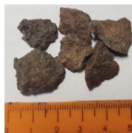
Fig. 3. Calama 022

Methods: We conducted the measuring of the reflectance spectra, based on the methods previously used for the experiments on physical simulation of photometric and spectral characteristics of satellite and asteroid surfaces [2]. We used a small-size monochromator with a 3-4 nm/mm dispersion concave diffraction grating. As a receiving instrument, we used a photoconductor which is sensitive within the range of 400-900 nm. The incident and scattering light beams formed the angles of 0 and 45 degrees, respectively, to the sample surface normal. For the standard, the flat surface of MgO was used. The relative error of the measurements was 3-4% in the middle of the spectral range and grew up to 10-12% at the range's limits.