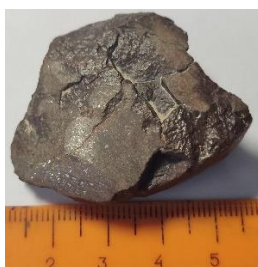
Fig. 2. Sierra Gorda 007