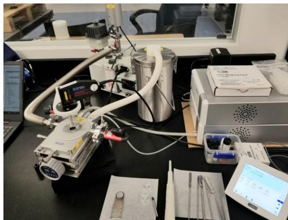
Figure 1. The fully assembled setup used in this study.

Linkam T95-LinkPad System Controller, which acts as the hub for the system components. A Pfeiffer Vacuum TPR 280 Pirani gauge reads the pressure from inside the stage to the T95 controller. An Edwards 1.5L rotary vacuum pump is used to bring the stage under vacuum. Attached to the vacuum pump is a MV196 motorized vacuum valve, which is controlled by the T95 and sets the pressure inside the stage to between 10^3 and 10^{-3} mbar. A Linkam LNP95 liquid nitrogen pump system is also connected to the stage and T95, and can cool the sample down to -196^\circ\text{C} . Both the temperature and pressure inside the stage are manually set using the T95 controller.