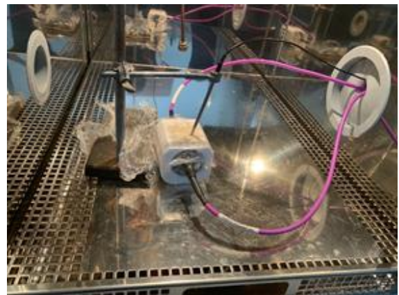
Figure 1. Measurement device inside the climatic chamber.

Measurement procedure: We analyzed the dielectric behavior of a sample of Texas Montmorillonite Stx-1b (obtained from The Clay Mineral Society). Measurements of dielectric properties were carried out on one oven-dried aliquot of the sample, and on one containing 56% water. The measurements were performed inside a climatic chamber, monitoring the temperature with three Pt (Platinum Temperature) sensors: one inside the sample and the other two inside the chamber. We measured the dielectric properties of the sample in the temperature range 200-290 K, setting a slow cooling/warming cycle (temperature rate 0.04°C/minute), to ensure that the sample inside the cell was in thermal equilibrium during measurements. Data were collected every 5 minutes during freezing and warming cycles.