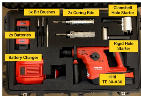
Figure 3: Honeybee Robotics' coring drill used for sample collection.

Detailed planning eliminated some of the challenges and minimized contamination concerns. For example, the drill bits were mechanically cleaned with IPA and wrapped in foil before deployment in the field. Drilled samples were collected in sterile cups with glove changes in-between sample collection events to minimize contamination.