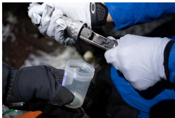
Figure 4: Aseptic transfer of collected core sample to sterile container.

Detailed planning eliminated some of the challenges and minimized contamination concerns. For example, the drill bits were mechanically cleaned with IPA and wrapped in foil before deployment in the field. Drilled samples were collected in sterile cups with glove changes in-between sample collection events to minimize contamination.