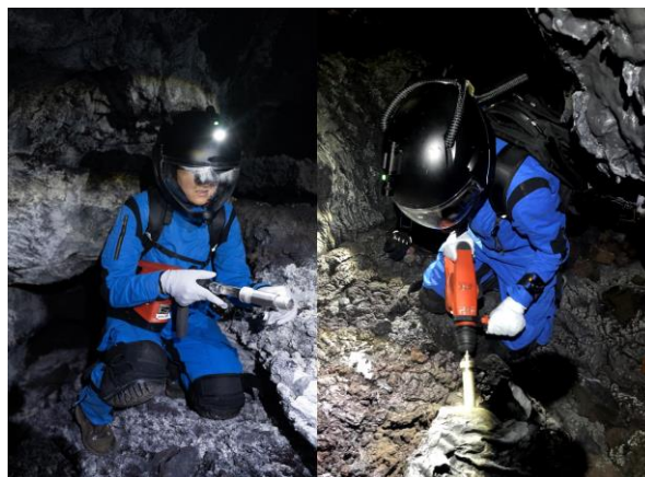
Figure 2: Astronaut-drilling simulation using Honeybee Robotics' coring drill. Lunar analog astronaut suits were worn during field work to simulate "extravehicular activity".

During a two-week lunar simulation, the Honeybee coring drill was used at HI-SEAS surrounding lava tube habitats for sample collection. Field research was conducted in lunar analog astronaut suits, creating new observations for aseptic sample collection and drill assembly.