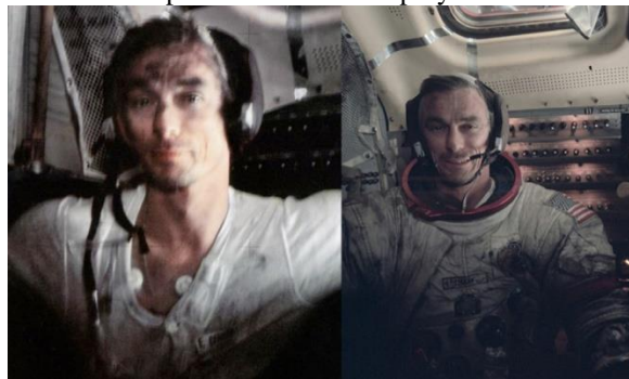
Figure 1. Eugene Cernan after a spacewalk (Apollo 17)

Introduction: The previous manned missions to the Moon represent milestones of human ingenuity, perseverance, and intellectual curiosity. However, one of the major ongoing concerns is the array of hazards associated with lunar surface dust. Not only did the dust cause mechanical and structural integrity issues with the suits, the dust ‘storm’ generated upon reentrance into the crew cabin caused “lunar hay fever” and “almost blindness [1-3]” (Figure 1). It was further reported that the allergic response to the dust worsened with each exposure [4]. The lack of gravity exacerbated the exposure, requiring the astronauts to wear their helmet within the module in order to avoid breathing the irritating particles [1]. Due to the prevalence of these high exposures, the Human Research Roadmap developed by NASA identifies the Risk of Adverse Health and Performance Effects of Celestial Dust Exposure as an area of concern [5]. Extended human exploration will further increase the probability of inadvertent and repeated exposures to celestial dusts. Going forward, hazard assessments of celestial dusts will be determined through sample return efforts prior to astronaut deployment.