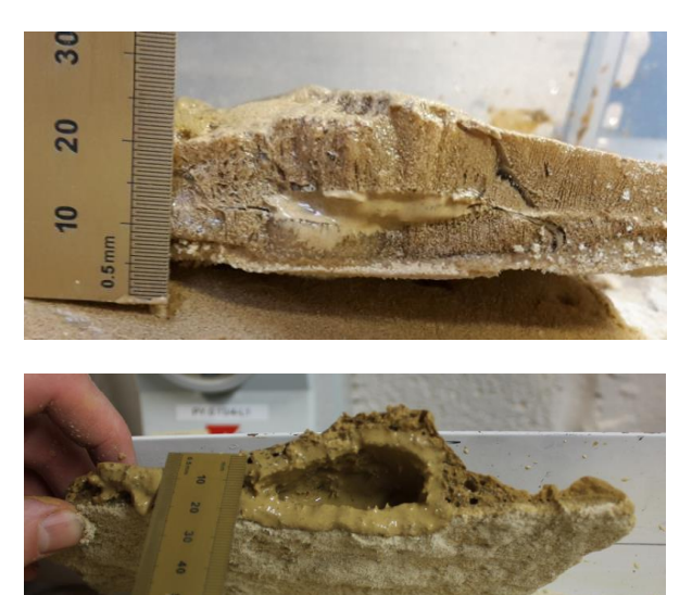
Figure 2: Details of the exposed inner structure of the two different frozen mud flows in which the liquid core was still present. Note the bubbles trapped in ice near the ruler.

A narrow flow developed in contrast to the broad flows observed in experiments performed under normal pressure. This morphology occurs due to the formation of frozen bounding ridges that control the flow of the liquid mud inside a central channel. With time even the top of the mud flow started to solidify and a continuous crust formed all around the flow. However, the flow was still able to propagate (Fig. 1b). This implies the formation of a 'mud tube' (analogous to a lava tube) in which the mud was able to move to the front of the flow.