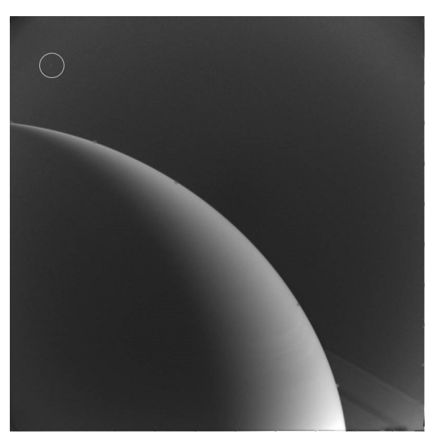
Figure 1. Voyager image C3496728, with Enceladus circled.

References: [1] Smith B. A. et al. (1981) Science , 212 , 163-191. [2] Hansen, C. J. et al. (2006) Science , 311 , 1422-1425.