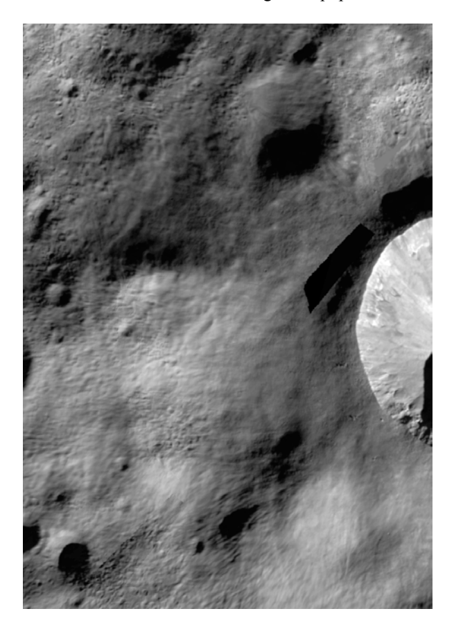
Figure 3. Secondary craters associated with 10.6-km Arruntia crater, Vesta. Note tight clustering of similar-sized craters ~1 diamter from crater rim.

Incipient secondaries are found as clustered irregular depressions at Fabia crater (D~12.5 km). True secondaries are found at Arruntia crater (D~10.6 km) (Fig. 3). These are found on the west, north and south perimeter approximately 1 crater diameter from the rim. They are absent from the eastern quadrant. Irregularly distributed clustered secondaries are found to the north of Marcia crater (D~62 km), but are otherwise difficult to distinguish from background. The degree to which distal secondaries are significant generally is difficult to extract from the background population.